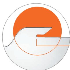
G-Rounding Partial hardening

For years now, KERN-LIEBERS elements have been leading the field in the fully-fashioned stockings sector, in part because of the benefits of rounding. The KERN-LIEBERS G-Version has become an indispensable market term for this product group. The perfectly rounded sinker guarantees an even and consistent stitch pattern.